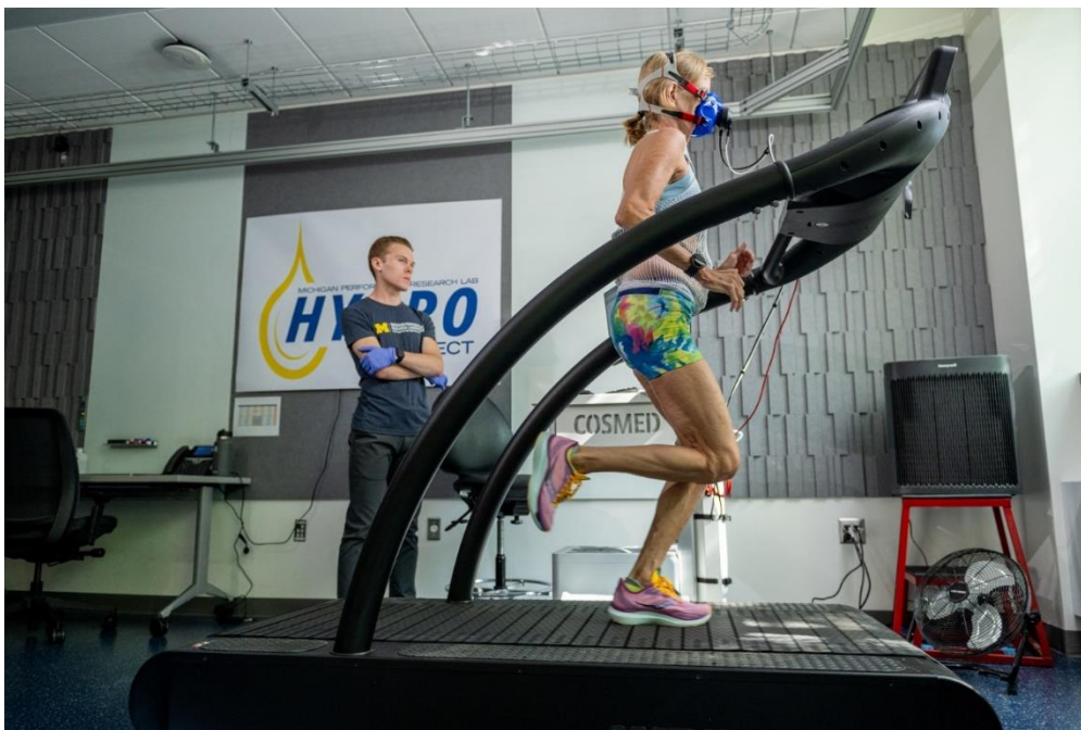
A research participant helps a student test wearable exercise technology in the Michigan Performance Research Laboratory

The School is also home to two university-wide initiatives: The U-M Concussion Center and the Health Performance & Sport Science Center . The School has also received its first "P" Grant and established, in partnership with Penn State University, the Roybal Center , which translates basic discoveries about motivations and behavior change into scalable and potent interventions and real-world tools to improve physical activity adherence and enhanced cognitive function.