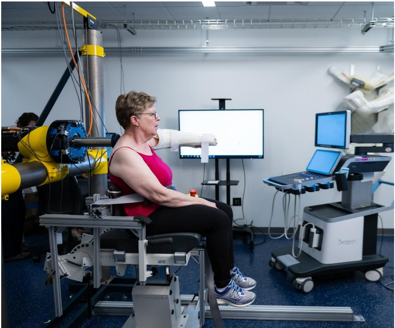
A research participant undergoes surface electromyography (EMG) in the Musculoskeletal Biomechanics & Imaging Laboratory

Consistently across the School's constituents, the community deeply values how the SoK has maintained its "small-school feel" despite its rapid growth. It is essential that the next Dean stay focused on the main goal: to deliver an excellent education to students so that they may thrive on whatever path they choose after graduation. The Dean will invest in a practice of visible leadership – extending and taking opportunities to interact with faculty, staff, and students outside of their office, walking the campus, and striking up informal conversations that build relationships. They will invest in learning each discipline's strengths and challenges. They will build authentic relationships with faculty, students, and staff. They will be more interested in elevating others to success than in promoting their own. They will be the School's best advocate and champion.