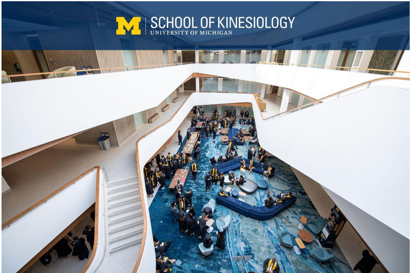
An aerial view of graduating students getting ready for commencement in the Kinesiology Commons