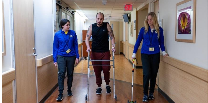
Students help a patient at Michigan Medicine improve his mobility