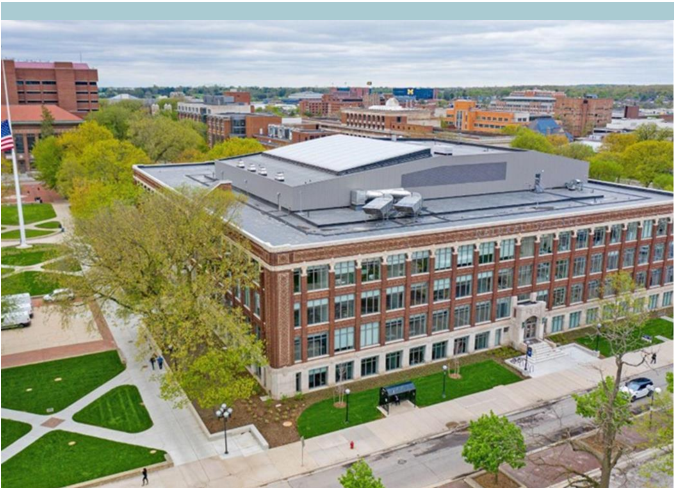
An aerial view of the Kinesiology Building