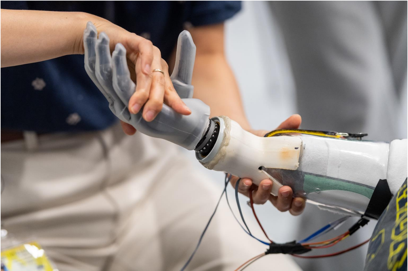
A student in the Rehabilitation Biomechanics Laboratory helps a research participant test a new prosthetic hand

In alignment with the vision of the University, the School of Kinesiology also celebrates and is committed to culture, equity, & community , which enriches the learning environment and enhances innovation and overall productivity. Through SoK's core values of collaboration, creativity, inclusion, integrity, and respect, they seek to ensure a positive, supportive climate in which all individuals are welcome.