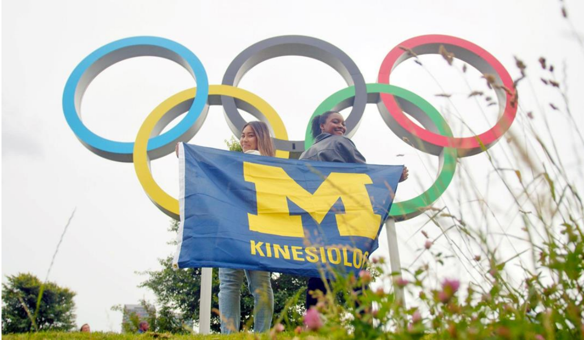
Students visit the International Olympic Committee Headquarters and other European Olympics venues