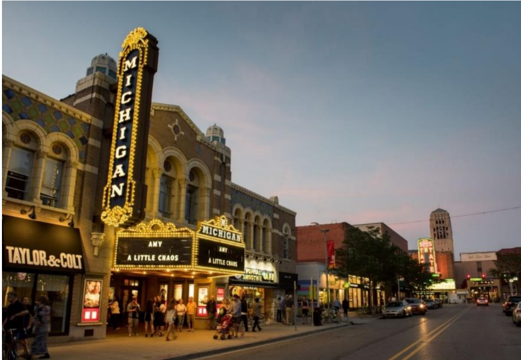
Liberty Street is home to two iconic art-house theaters and many local shops and restaurants