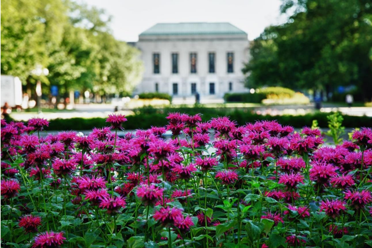
Summer flowers bloom in front of Rackham Graduate School